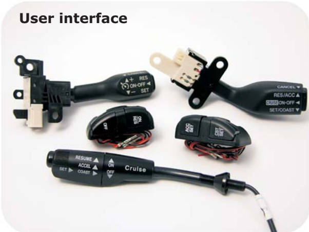
Individual solutions, switches, standard arm and OEM arm