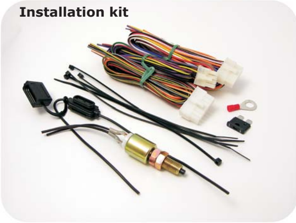
Adapted to the individual vehicle