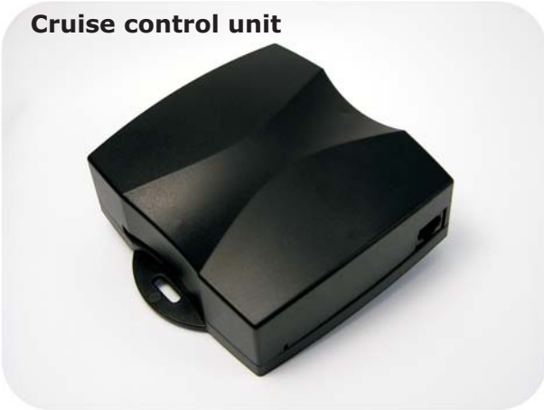
Preprogrammed to the individual vehicle